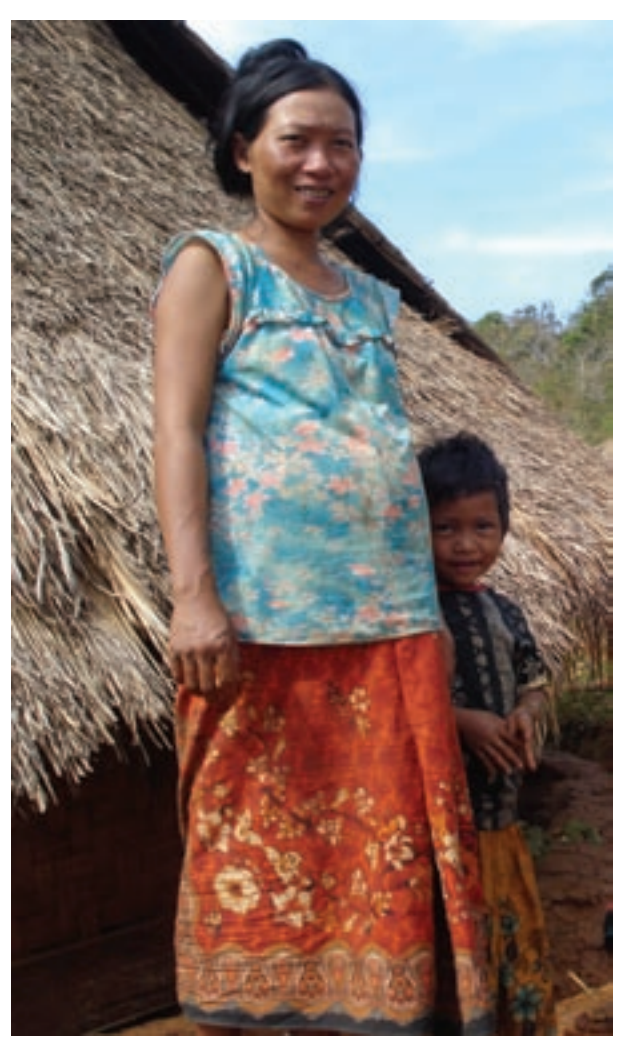
Indigenous woman and child in Cambodia

Moreover, the cost of providing health services in areas where indigenous people live is often higher than in majority communities, as they live in remote, sparsely populated regions. Where finance is short, governments and donors emphasise the need for cost effectiveness and tend to focus on areas where costs are lower, further excluding indigenous people. However, as this report sets out to demonstrate, healthcare that effectively reaches indigenous people and other cultural minorities does not need to be hi-tech or expensive. The seeds of change can be found in the communities' own approach to health.