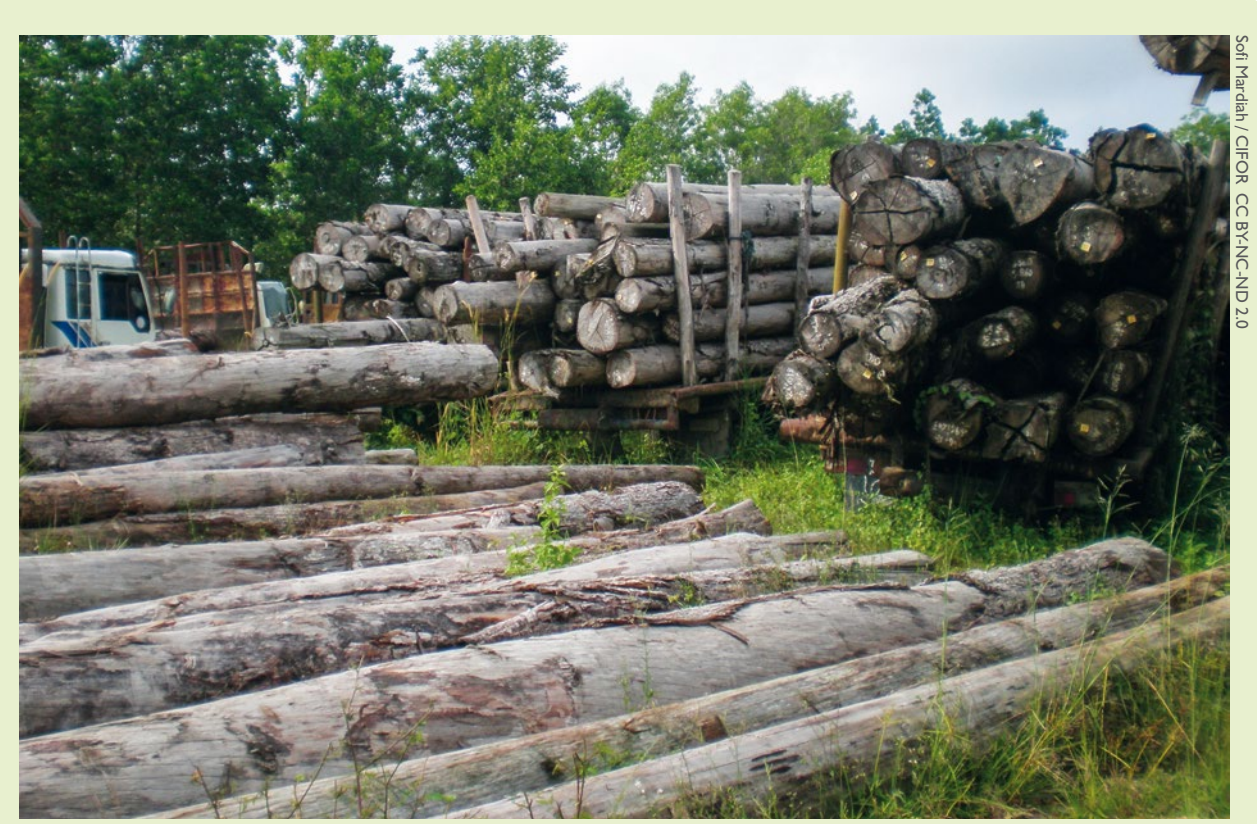
Riau, Sumatra, Indonesia: Illegal logs seized in transit and impounded in a log yard.