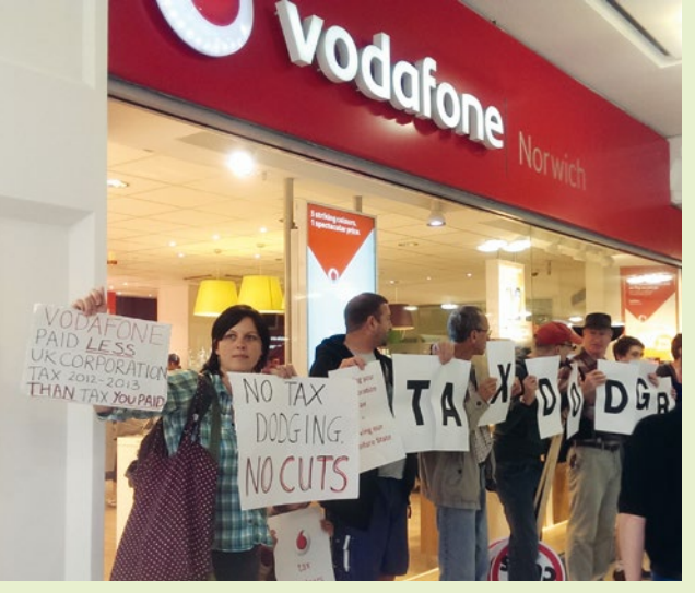
Norwich, June 2014: Activists demonstrate outside Vodafone stores as part of a national day of action highlighting tax avoidance called by UK Uncut. Top : Brighton, December 2010: UK Uncut target the Arcadia Group.

brands: Barclays, Boots, Topshop and Vodafone. Using creative peaceful, direct action – activists glued themselves to the windows of a Topshop store – UK Uncut raised awareness about tax injustice in a way few organisations had managed before. They even helped force Starbucks to pay \pounds 20 million more in corporation tax.<sup>57</sup>