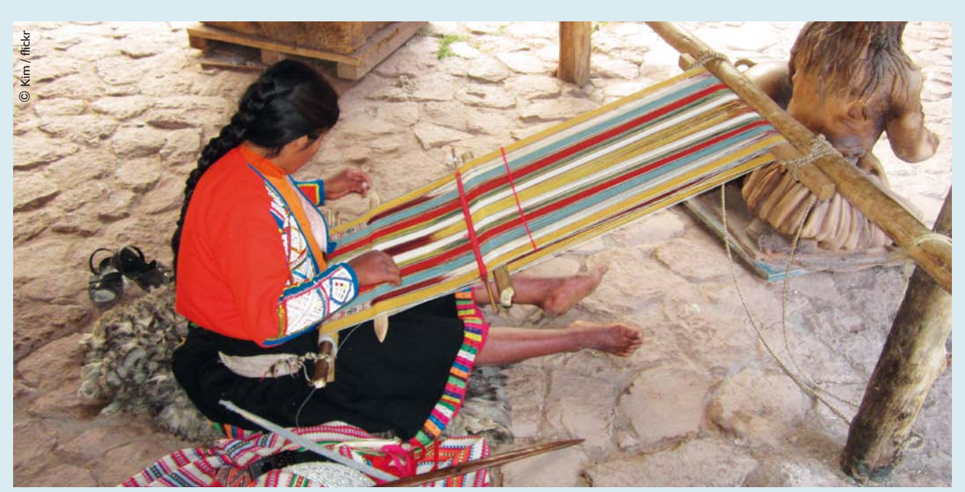
Opportunities for women in the licit economy can provide important alternatives to involvement in the illicit drugs market.

To address the disproportionate impacts of drug control policies on women and ensure the achievement of SDG Goal 5, a review of drug policies with a strong gender perspective should be conducted to develop alternative policy approaches that actively promote, rather than limit, the achievement of gender equality and women's empowerment.