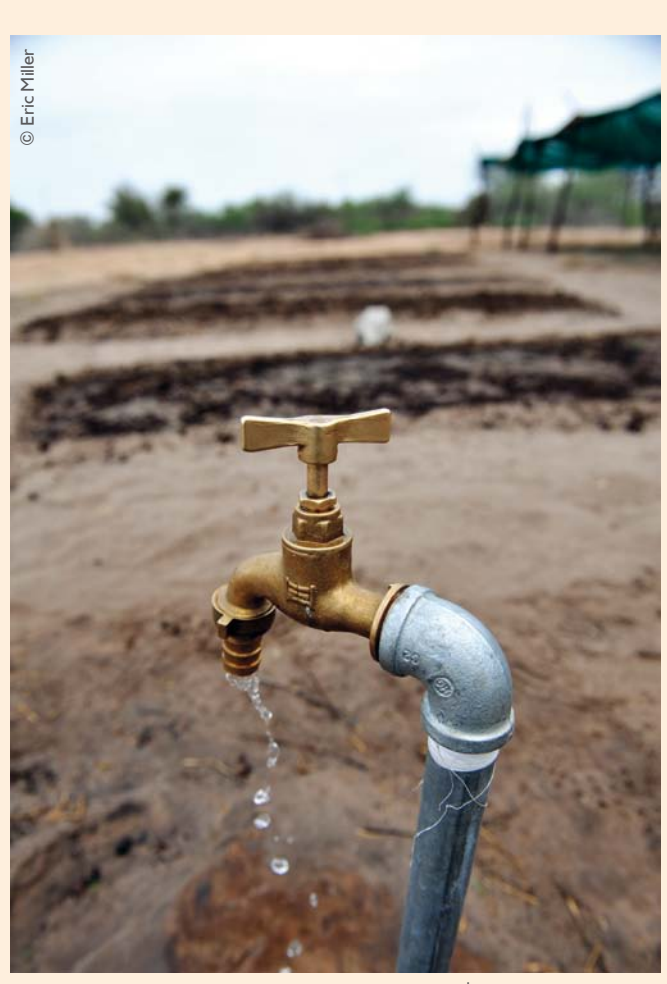
The ODI estimates it will cost an additional US$26.8 billion annually to achieve the targets of universal access to water and sanitation under Goal 6.