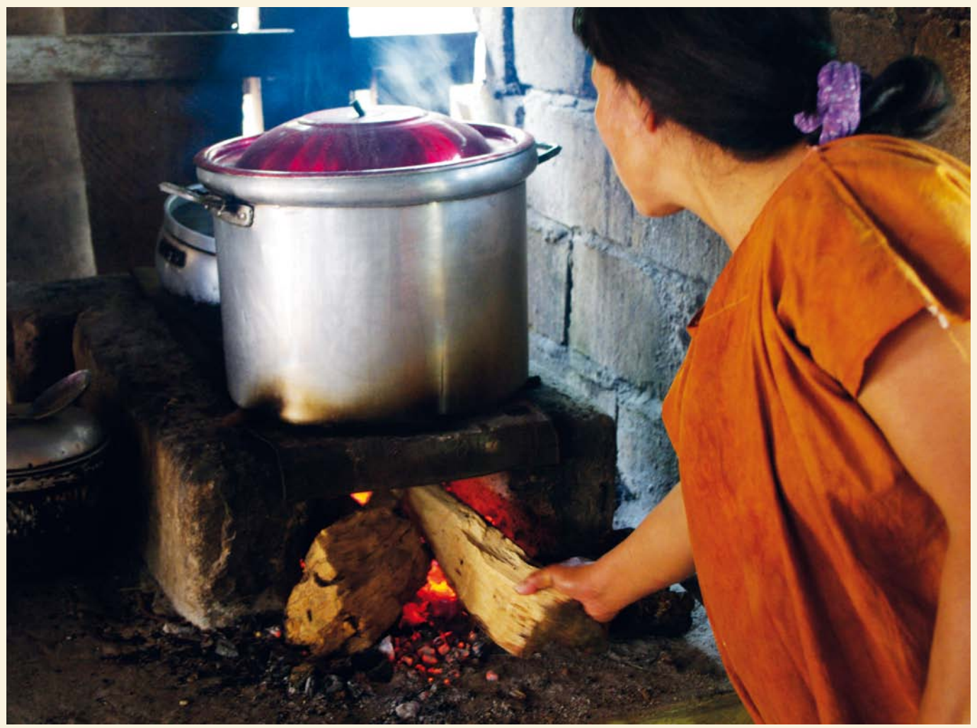
Food security should be a central concern to increase coherence between development and drug policy.