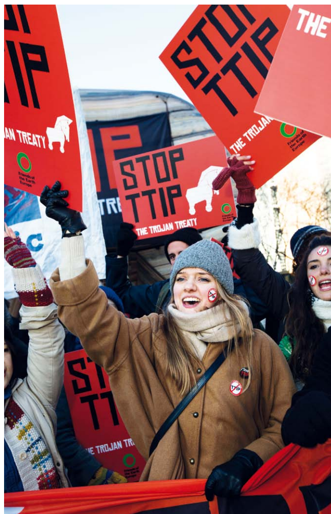
Stop TTIP protesters gather outside the European Commission in Belgium, February 2015.

These changes in diet have health implications. Several studies of the diets of Pacific Islanders found a positive correlation between increased consumption of imported food and a rise in rates of obesity and chronic diseases. 20 Another study examining the impact of the reduction of barriers to food imports in Central America found trade liberalisation was one of the factors contributing to increased consumption of processed foods including processed cheese, whey, French fries and snacks, with an associated increase in obesity and non-communicable diseases. 21